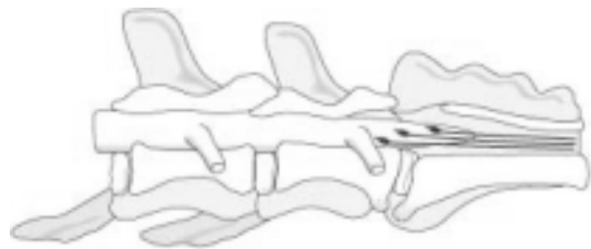
LOW BACK FOLLOWING SURGERY (Bone removed and nerves no longer pinched) (Fig. 3)

are markedly improved within 4-8 weeks, while others show a slow, gradual improvement over 6 or more months. Although no guarantees can be given with any medical or surgical treatment, most low back problems will respond favorably to proper treatment. The rate of recovery depends, in part, on the age and general health of your pet as well as the length of time the problem has occurred prior to surgery.